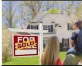
Moderate Income Workers