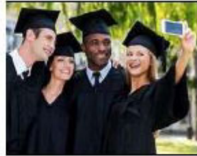
Moderate Income Workers