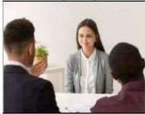
Moderate Income Workers