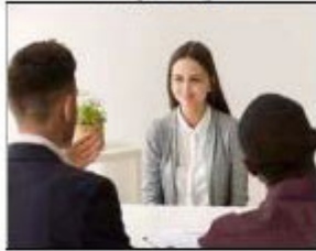
Moderate Income Workers