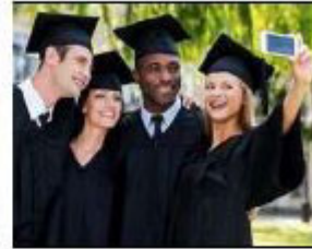
Moderate Income Workers