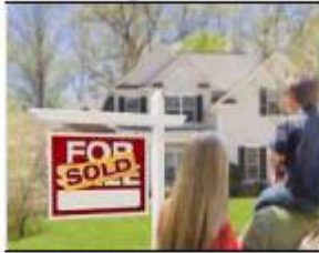
Moderate Income Workers